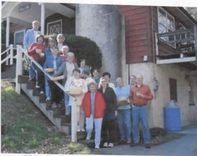
The whole gang at the Retreat in April.