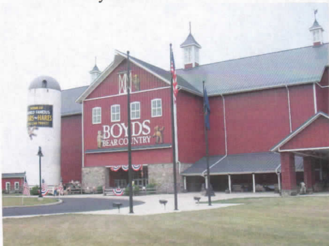
Thanks to Boyd's Bear for allowing us to demonstrate basket weaving!